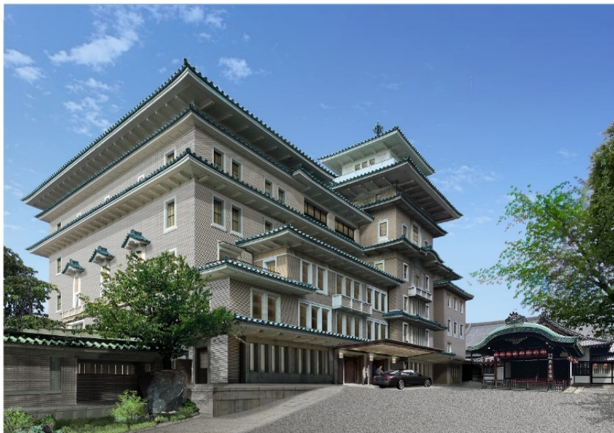
Photo: The current Main building's southwest exterior (preserved part)